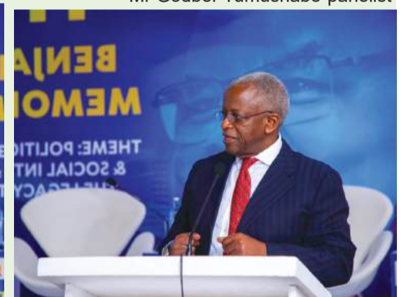
Hon Amama Mbabazi, Chief Guest