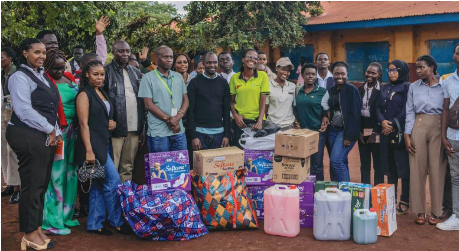
Students of International Relations and Diplomatic Studies at Kiryandongo Refugee Settlement.