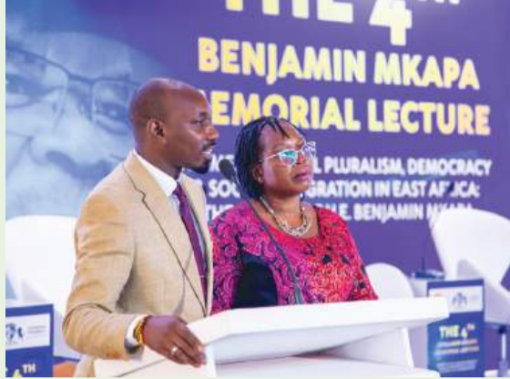
The hosts of the day