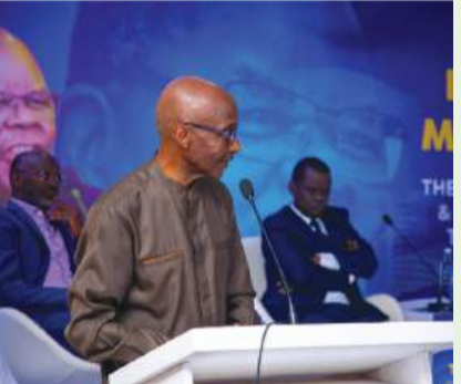
Gen. Edward Kalekezi Kayihura