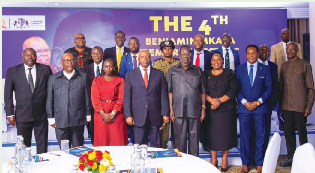
Guests come together for a memorable moment