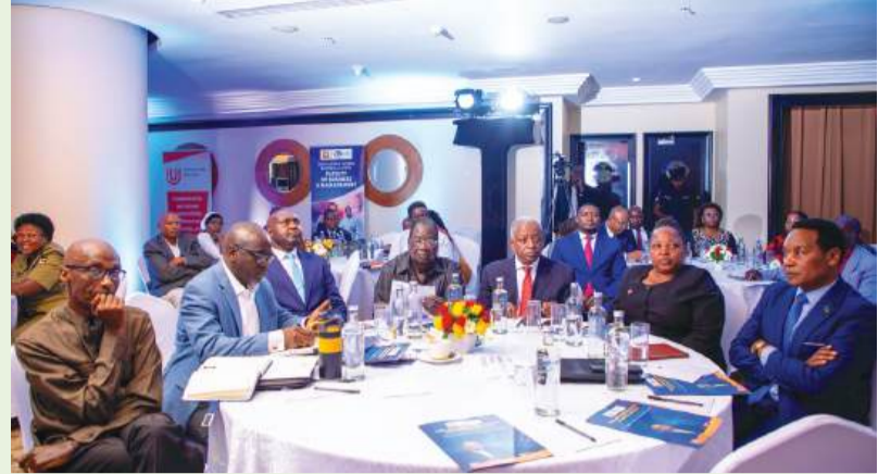
The Guest of Honour and Chief Guest take up their seats to grace the function