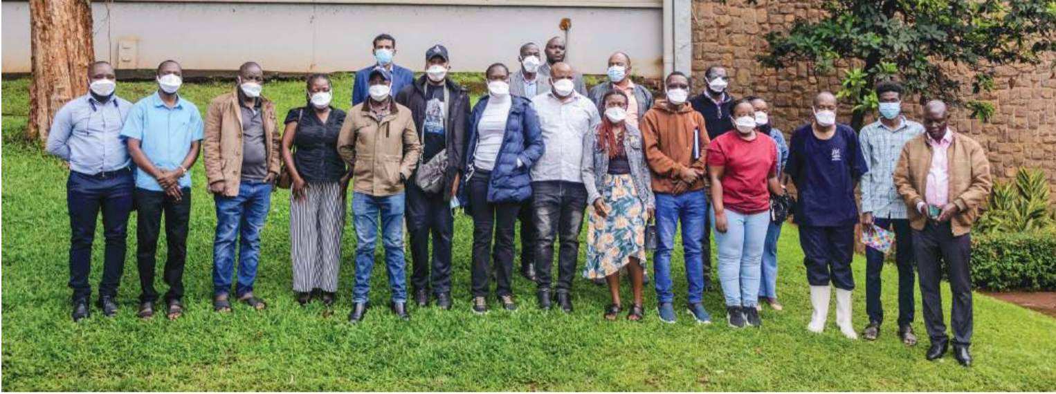
Cavendish students and lecturers pose for a photo with professionals from Mulago National Hospital after the Forensic practical training.