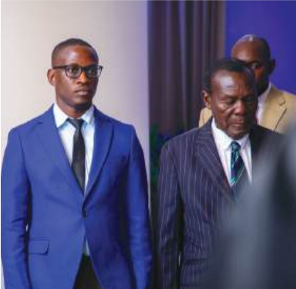
Let's rise for the anthems