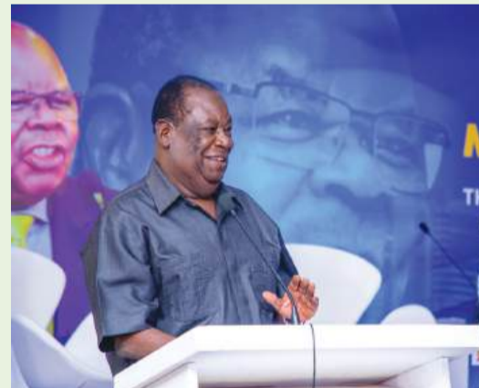
Hon James Magode Ikuya, Guest of Honour