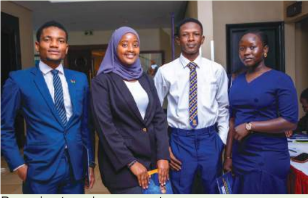
Preparing to welcome guests