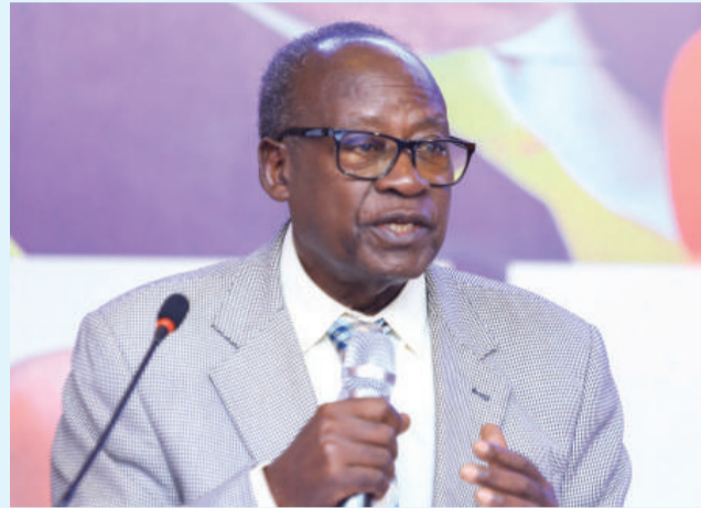
Chief Guest; Prof. Tarsis Kabwegyere