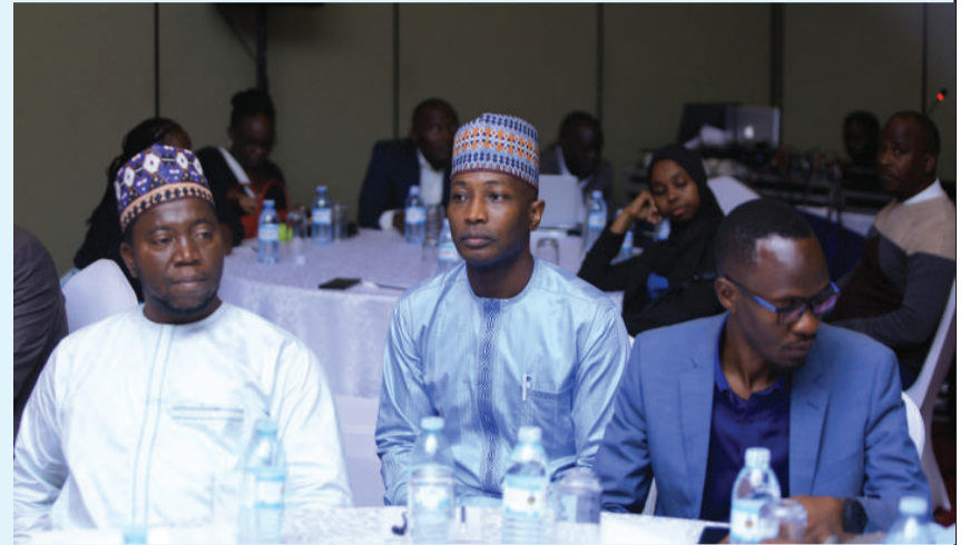
Some of the Cavendish University staff that were present for the memorial lecture