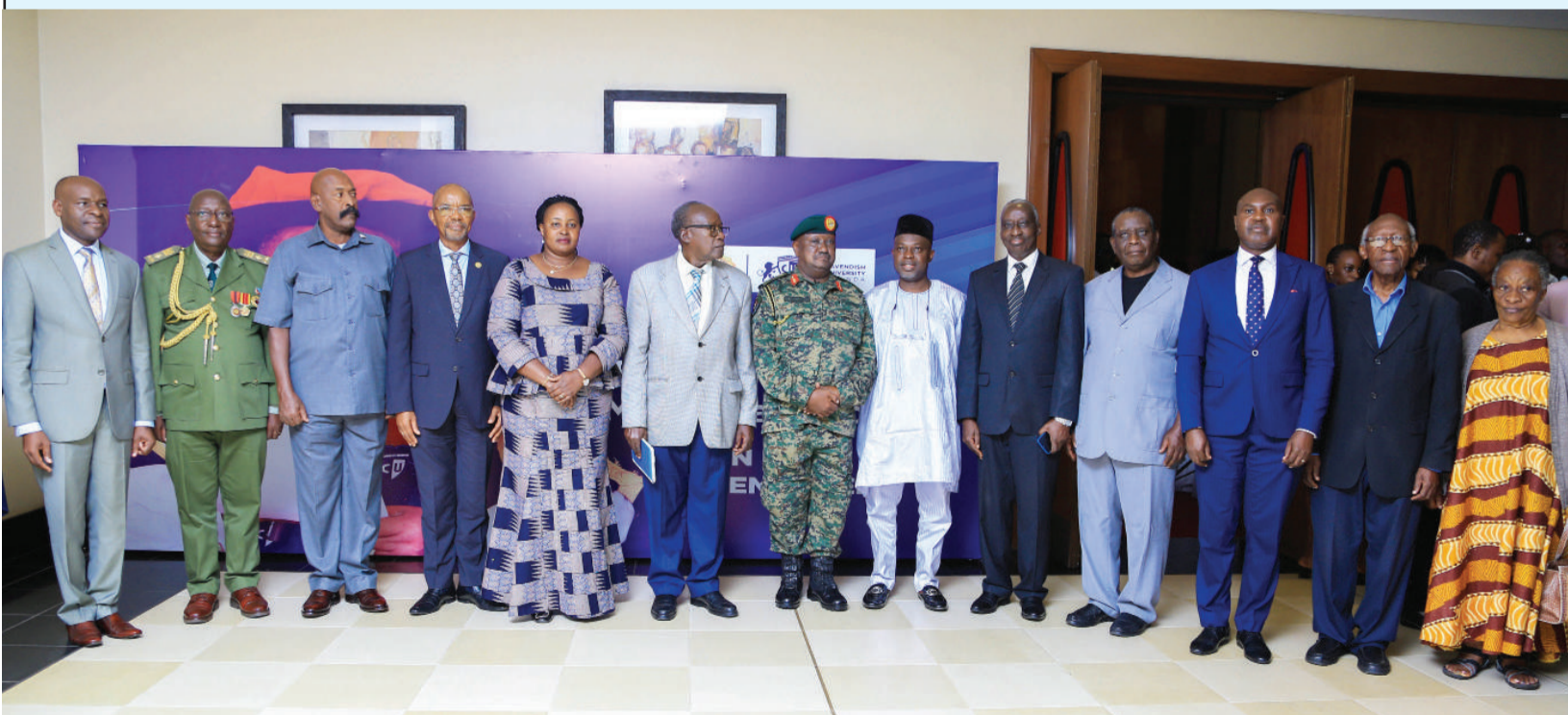
A photo moment of invited guests. This was after the memorial lecture at Sheraton hotel Kampala.