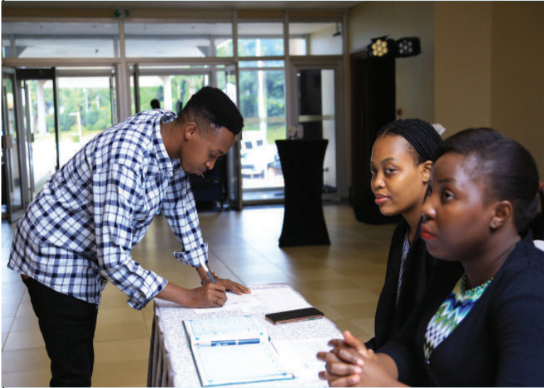
Arrival and Registration