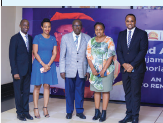
A photo moment with the chief Guest