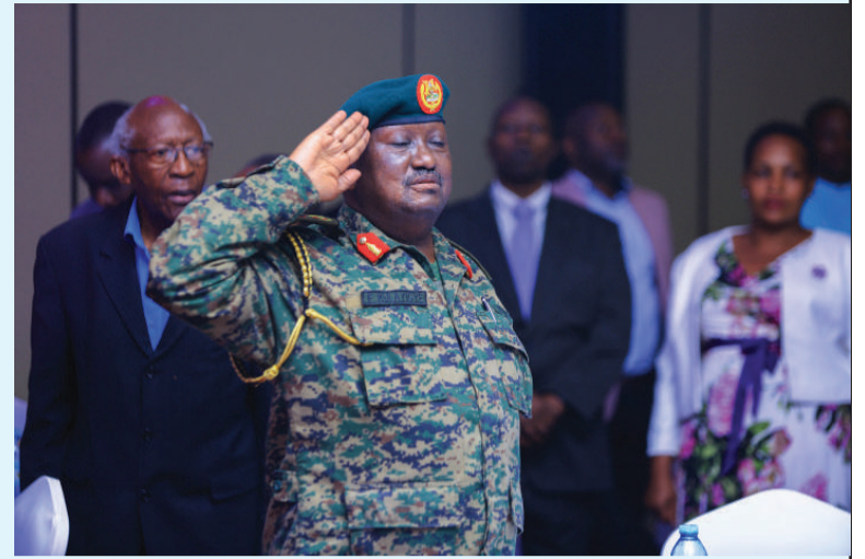
A salute for the late H.E Benjamin Mkapa