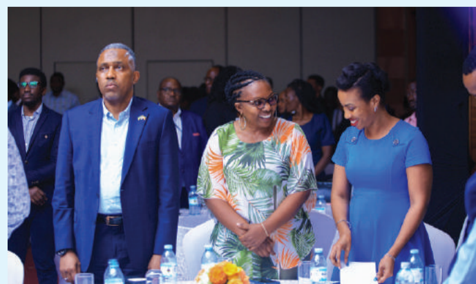
The team from Tanzanian High Commission was well represented