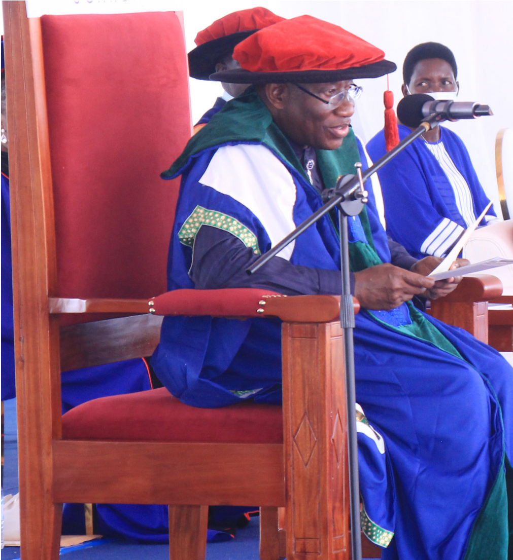
H.E Dr. Goodluck Jonathan presiding over the 11th graduation of Cavendish University Uganda on Thursday August 25 at Speke Resort Munyonyo.