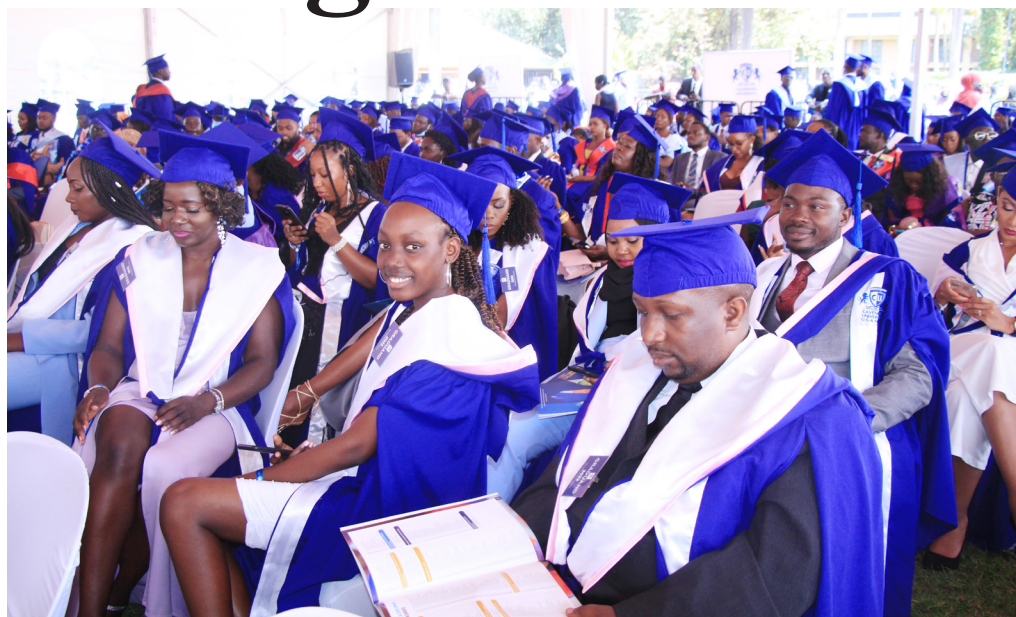
The class of 2022 graduands attend the 11th graduation ceremony at Speke Resort Munyonyo recently.