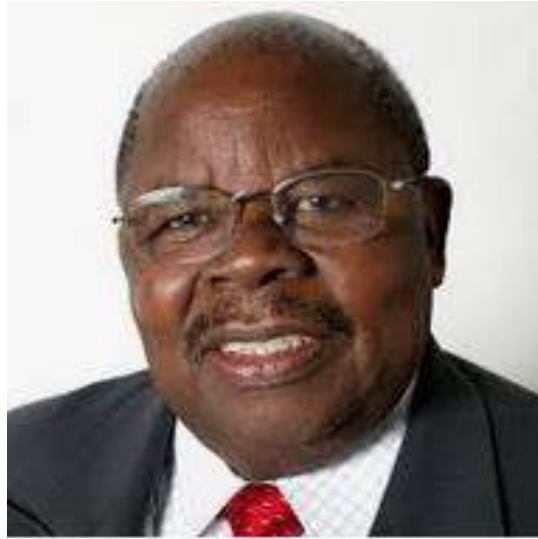
The Chancellor, H.E Benjamin Mkapa